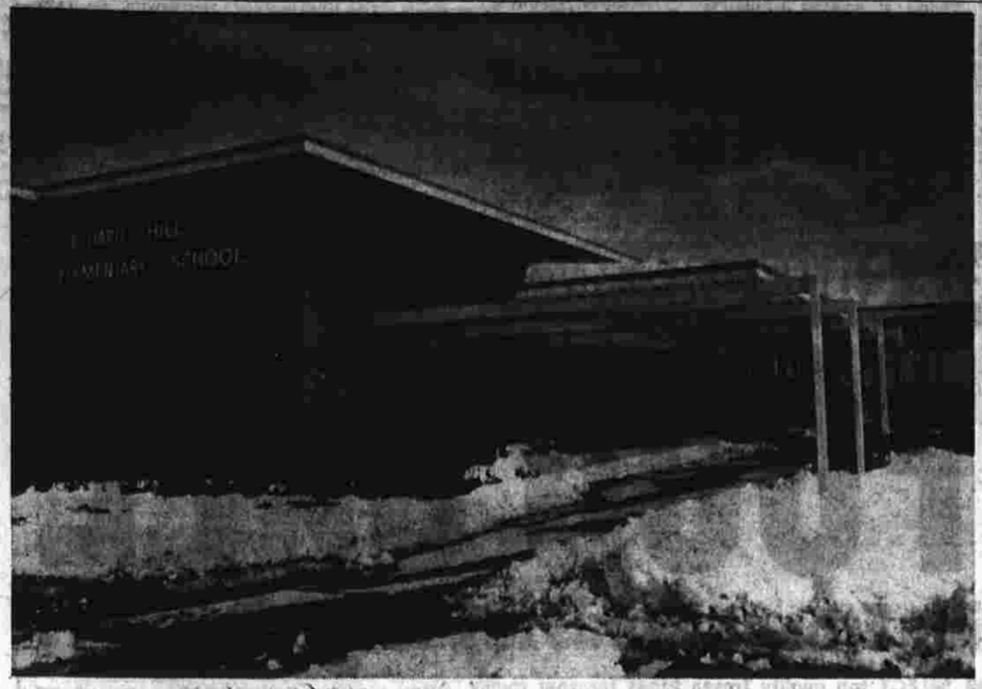
The main entrance was shoveled free of snow when the school opened a week ago.