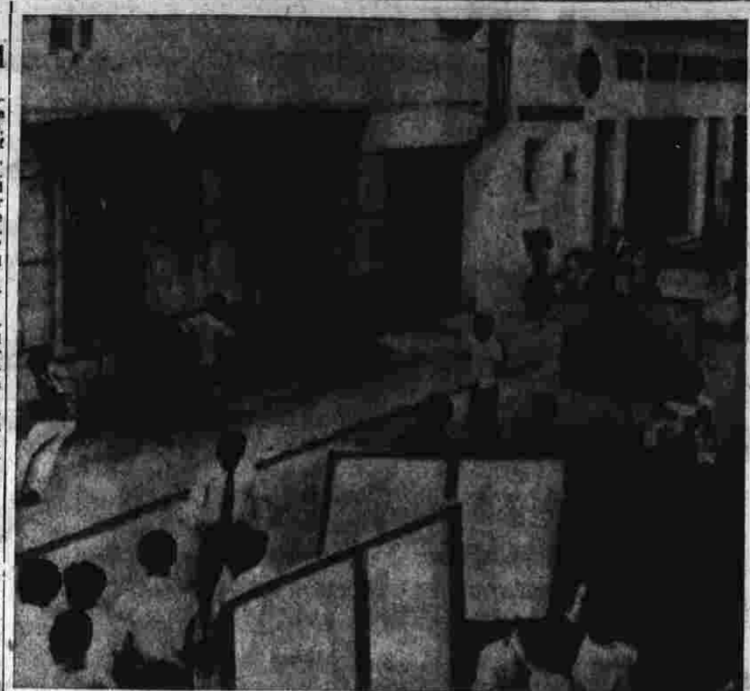
Attack on U.S. Embassy Rioters march with anti-American banners as other demonstrators attack the U.S. Embassy in Cambodia's capital city of Phnom Penh yesterday. Prince Norodom Sihanouk sent apologies but added he sympathized with the crowd for their "anger with the imperialists."